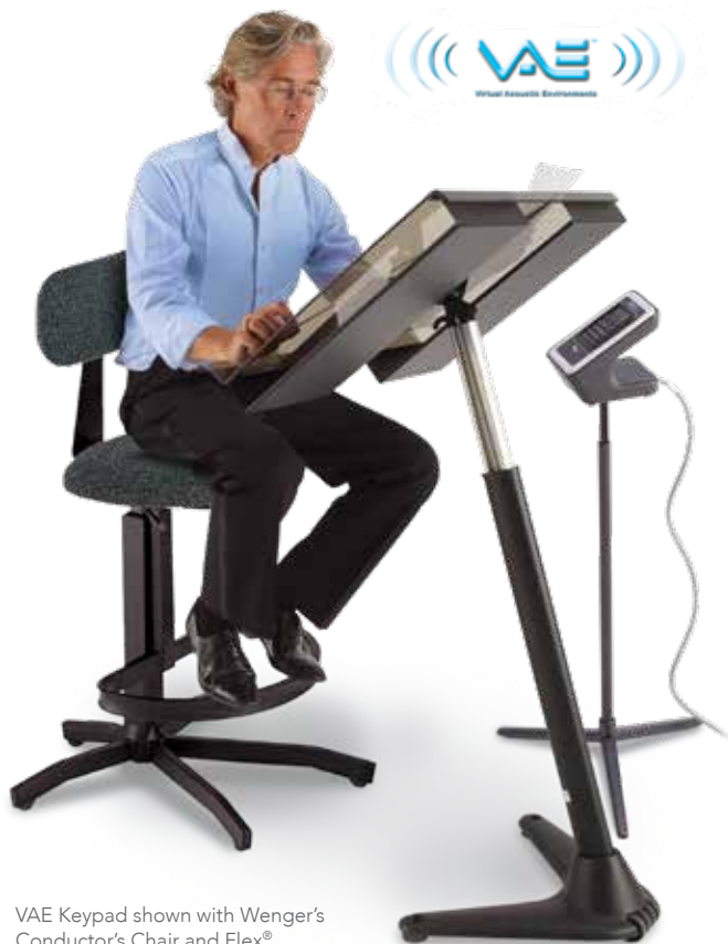
VAE Keypad shown with Wenger's Conductor's Chair and Flex® Conductor's Stand (sold separately).

What a musician hears in a rehearsal room can be quite different than what they will hear on stage in a recital hall or auditorium. This is due to the vastly different acoustical properties of the larger spaces.